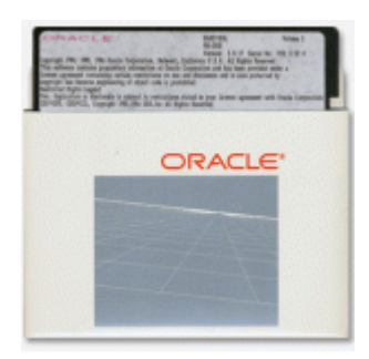
SQL in its natural habitat

Things like SQL injection attacks simply should not exist. They're a consequence of thinking of your database API as a programming language instead of a protocol, and it's just nuts that vulnerabilities still result from this poorly thought out 1970s design today.